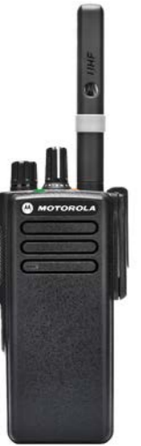
MOTOTRBO™ DP4400 DIGITAL PORTABLE RADIO

Call Alert - This feature can act as a pager system. Again the control radio can 'dial' the number of the radio they wish to alert. The radio selected will ring (like a telephone) until answered. (The radio initiating the call will automatically receive an acknowledgment back confirming the radio was 'switched on and in range' and that the pager message was received).