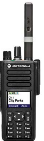
MOTOTRBO™ DP4800 DIGITAL PORTABLE RADIO

We are anticipating another busy year for our hire department and recommend that you book early for any requirements you may need throughout the remainder of the year.