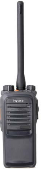
HYTERA PD705 DIGITAL PORTABLE RADIO