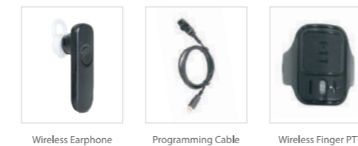
Wireless Earphone Programming Cable (USB Port) Wireless Finger PTT